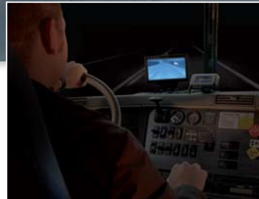
A monitor displaying the images of the PathFindIR, can be easily displayed on the dashboard. It quickly becomes a natural checkpoint for the driver similar to side view or rearview mirrors.